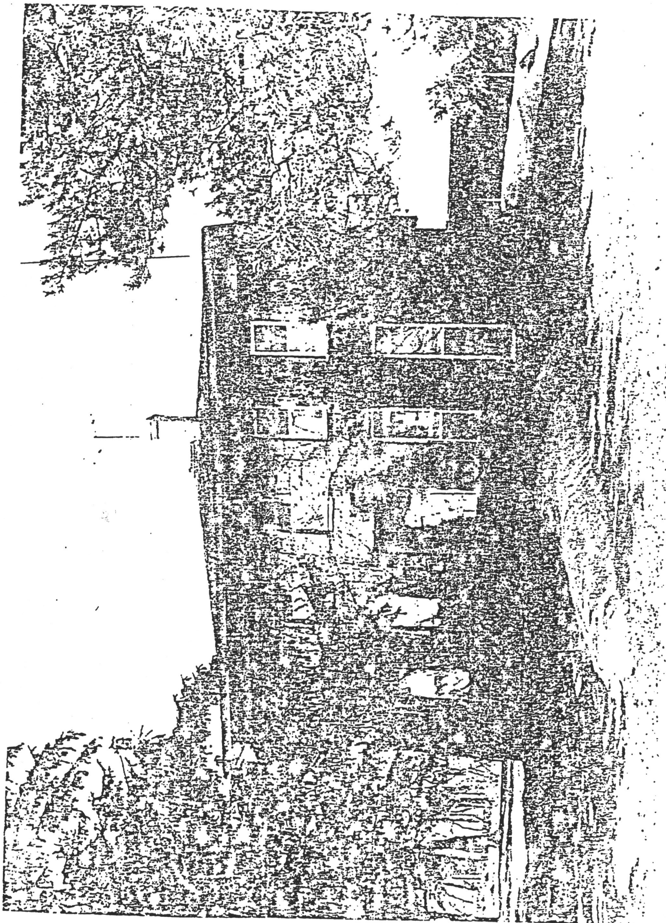
McIn, D.F., House, Farmington, Minnesota; 1976, View: Looking West, 02913/2